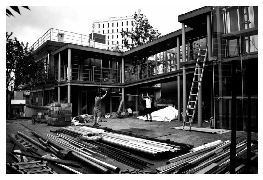
Fig. 3 – Negotiation of setup space with other construction works.

The air and water got confronted as commons in a challenging way. Due to the delays in the restoration of the village we were provided water supply from a hose connected to the courtyard of another pavilion. The tap leaked, and the participant allocated in that pavilion refused to have the tap open. It happened to be that their project was about water management in California. So droughts in the West Coast of the US got confronted with air pollution in Seoul. One common versus another one. Which, of course, is at the core of the difficulties of managing any common: to deal with one, others might be needed, and eventually