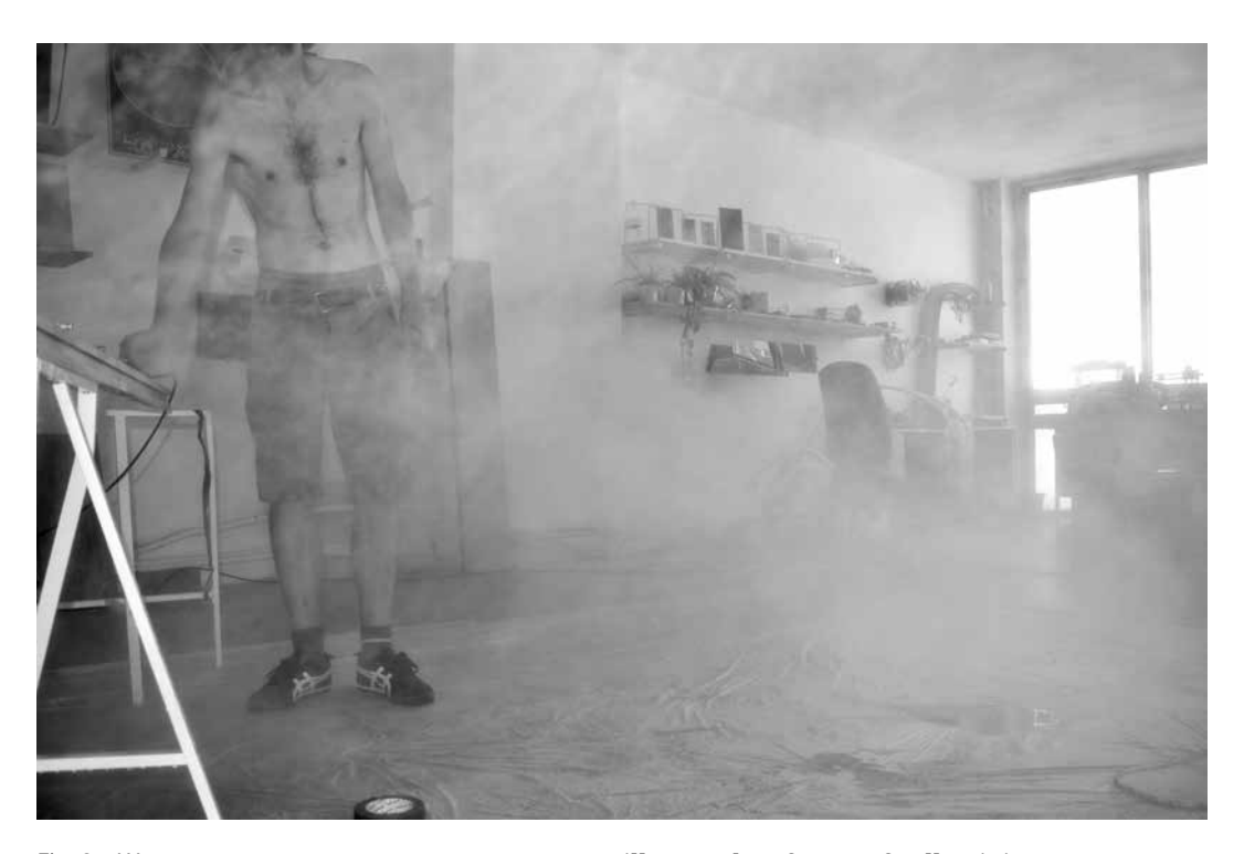
Fig. 2 – Water vapor tests in Barcelona. Image by the Author.

Instead of trying to control the air we had to train our bodies to be affected by the mist.