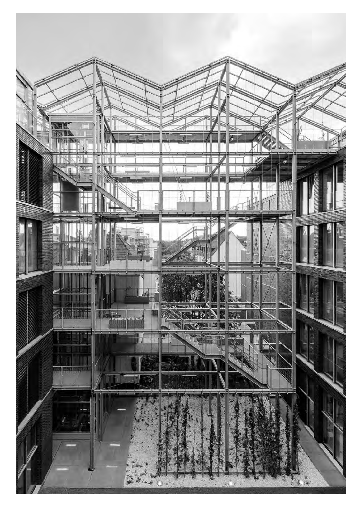
European Architectures in the Age of Climate Change