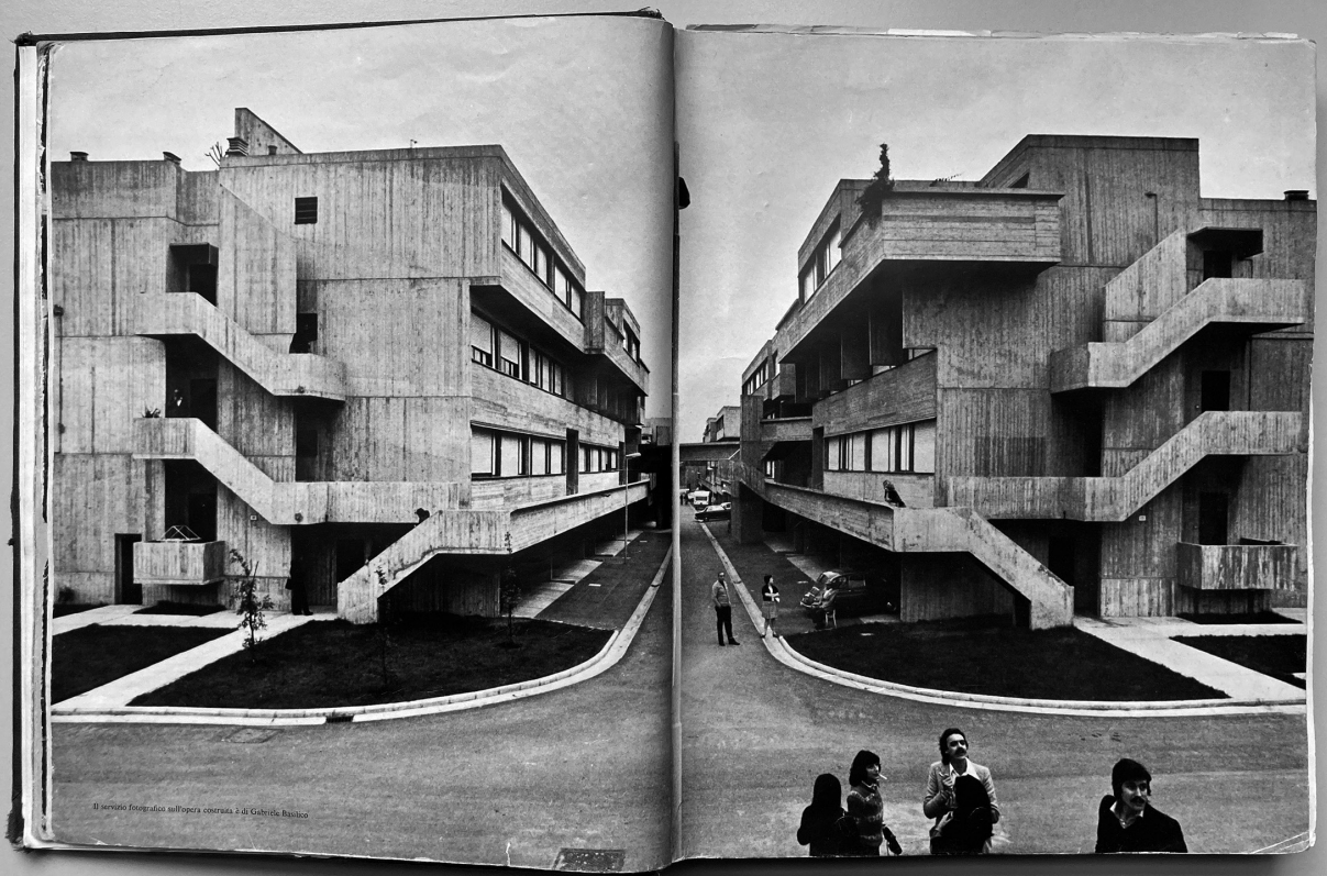
Fig. 1 - The Villaggio Matteotti in the two-pages photo by Gabriele Basilico published in the special section of "Casabella" dedicated to the complex. The image offers an inward-looking representation of the scheme, focused on the newly built public spaces and on the social life within them. Source: De Carlo et al., 1977: 24-25.