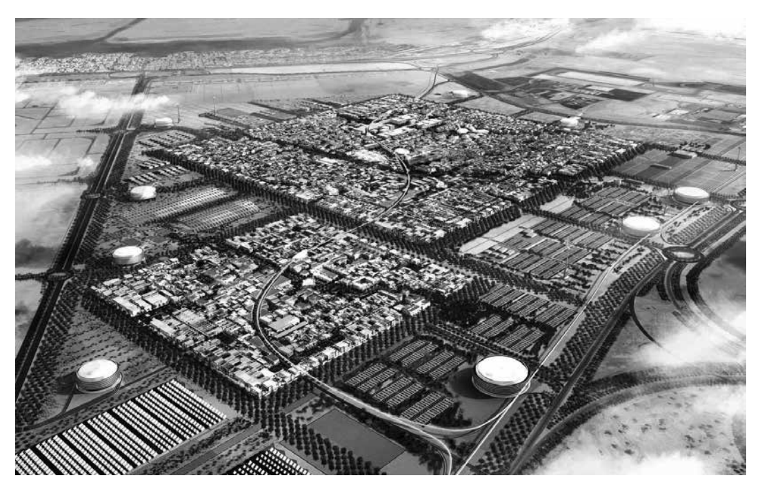
Fig. 4 - Masdar 3D masterplan.

The main actors of the Masdar City project, all contributed to the network that shapes and creates the project and advances its sustainability aims and targets to be translated in specific ways.