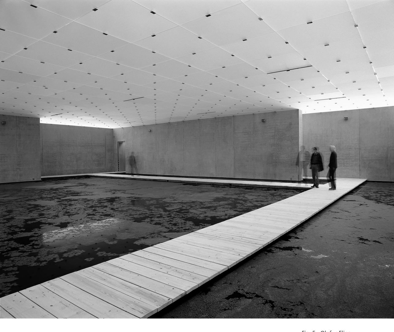
Fig. 5 - Olafur Eliasson and Günther Vogt, The mediated motion, 2001. Water, wood, compressed soil, fog machine, metal, plastic sheet, duckweed (Lemna minor), and shiitake mushrooms (Lentinula edodes). Installation view: Kunsthaus Bregenz, Austria, 2001. Photo: Markus Tretter. The artist; neugerriemschneider, Berlin; Tanya Bonakdar Gallery, New York / Los Angeles © 2001 Olafur Eliasson.