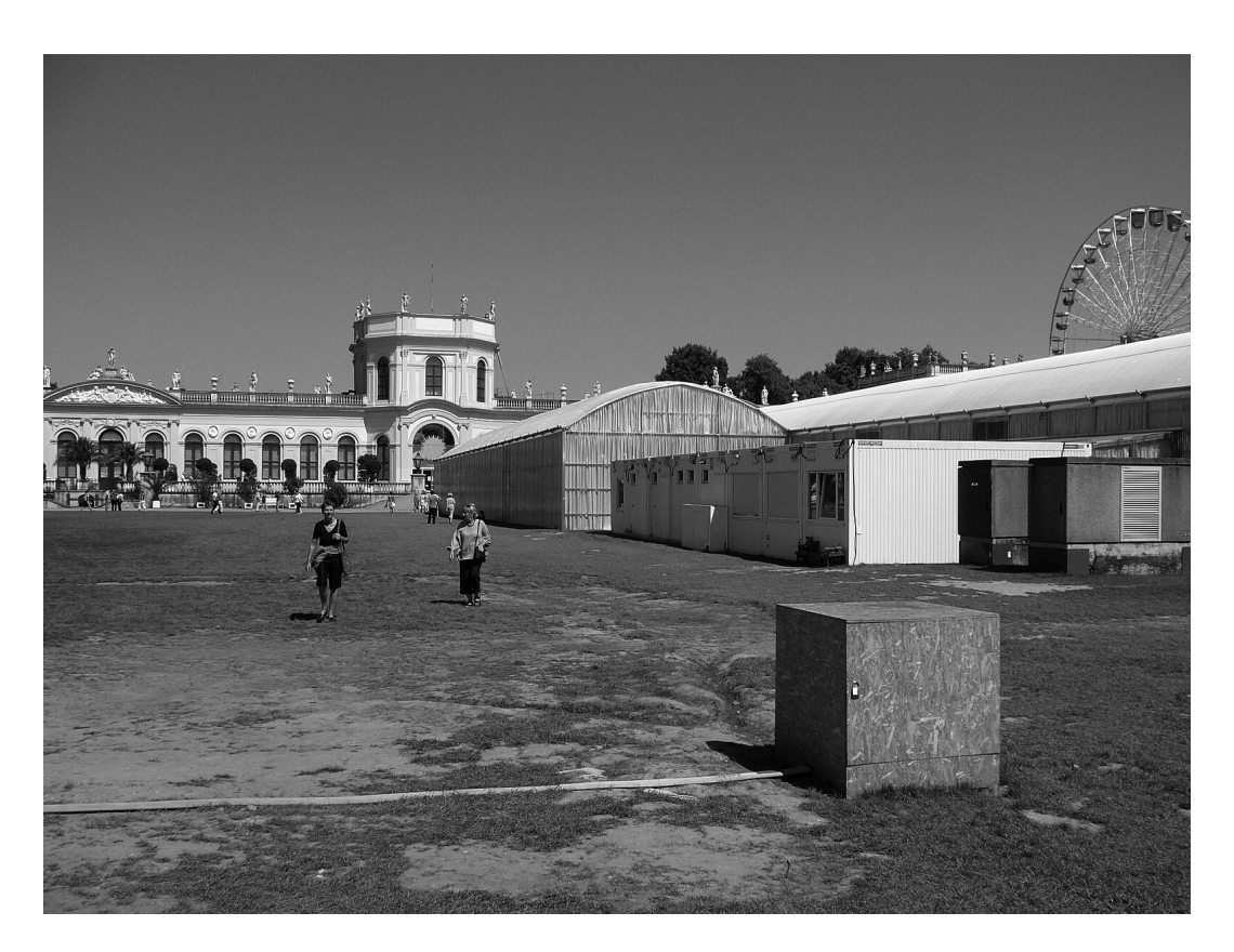
Fig. 6 - Lacaton & Vassal Architectes Karlsaue pavilion for Documenta 12, Kassel, 2006. Exterior view.

hybrid-use to urban farming buildings, recent design practices point to the fact that "green does not stop at a building's surface: it also penetrates the interior, to give the impression of living everywhere with nature" (Zardini, Borasi, 2012: 19).