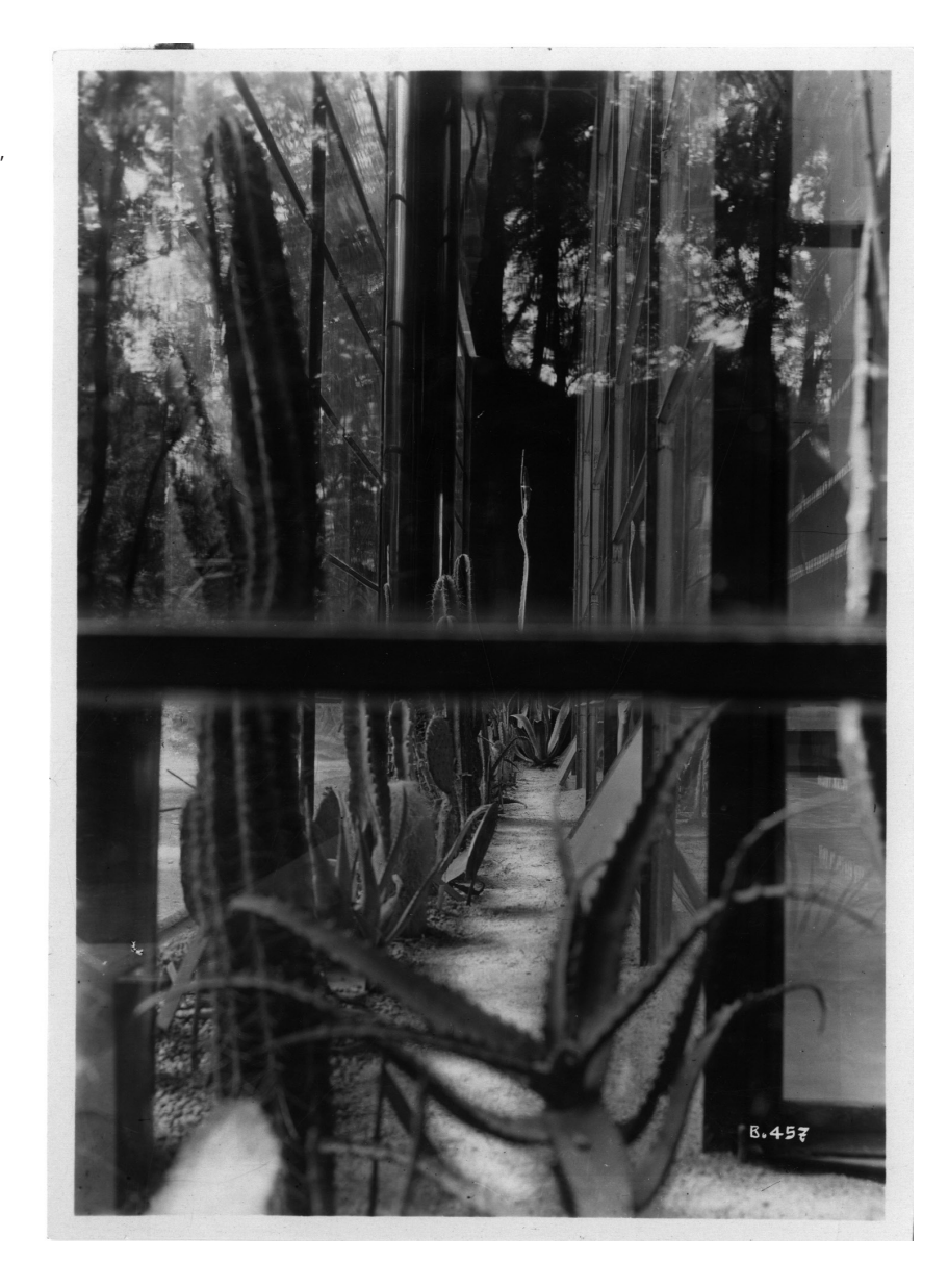
Fig. 2 -Luigi Figini and Gino Pollini, The greenhouse of "casa elettrica" [La serra della "casa elettrica"], Villa Reale di Monza, IV Triennale di Monza, 1930. TRN_IV_12_0665.