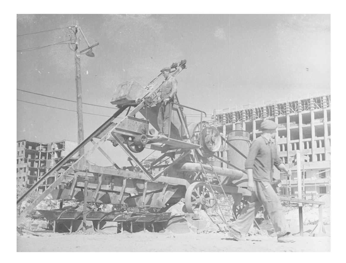
Fig. 6 - Rubble crusher and sorter in operation in central Warsaw, 1948. It is one part of the larger mechanical assembly producing air bricks, eighteen of which were acquired in Switzerland in 1946.

rogated if a look is taken at the transactions allowing coal-conserving rubble recycling to be pursued in the context of Warsaw's reconstruction.