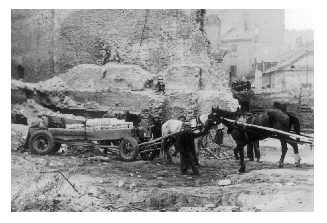
Fig. 2 - Brick salvaging in the ruins of the central Warsaw, 1948.

that had been salvaged (Przegląd Budowlany, 1948). Importantly, these data take no account of bricks obtainable with no market transaction needed, given the possibilities of theft or appropriation in the absence of inhabitants or owners for many a ruined building. The comparison of prices set by the dynamic local market was a crucial way in which employees of the reconstruction administration assessed the "rationality" of the specific material or construction technology in the immediate postwar period. However, many of them were also involved in the development of a planned economy and socialist politics in Poland. They therefore sought to depart from market price as the sole indicator of a rational and economically justified decision – a perspective associated at the time with decision-making under a capitalist economy. They searched for other indicators which would allow reconstruction materials to be assessed, such as: "[...] the amount of coal or oil needed to produce a given building material," as well as "the use of waste materials" in their production (Nechay, 1947: 35).